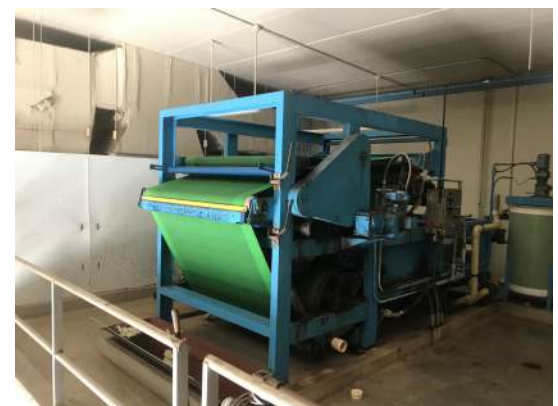
Figure 4. Sludge pressing equipment