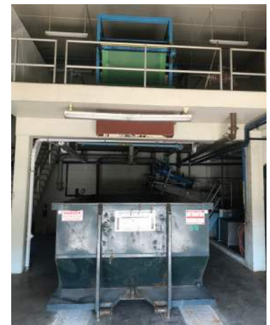
Figure 3. WWTP equipment

The operator commented that probably the best odor level test would be when he got home. If his wife would tell him, you pressed today didn't you! During two separate pressing cycles, his wife made no comments.