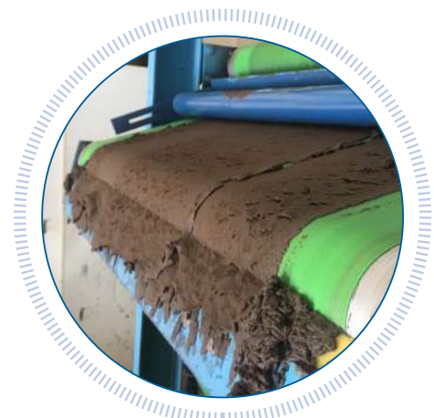
Figure 1. Sludge pressing equipment