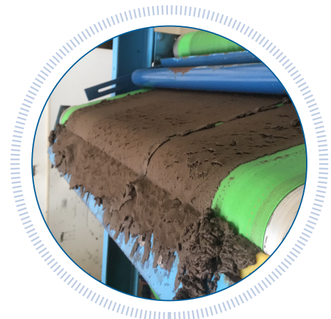
Figure 1. Sludge pressing equipment