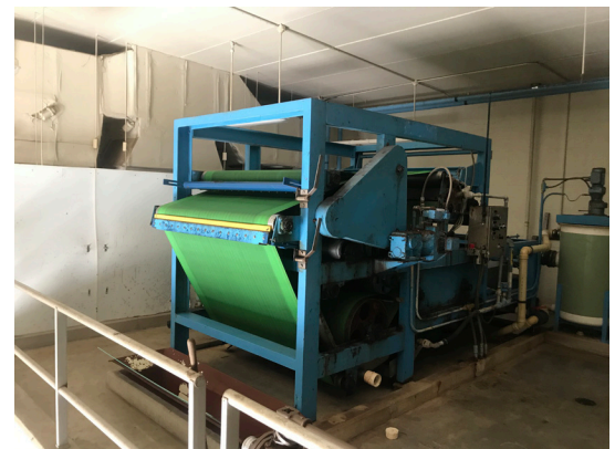
Figure 4. Sludge pressing equipment