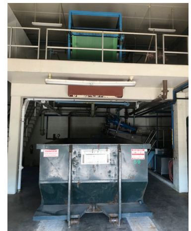
Figure 3. WWTP equipment

The operator commented that probably the best odor level test would be when he got home. If his wife would tell him, you pressed today didn't you! During two separate pressing cycles, his wife made no comments.