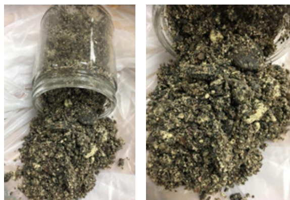
Figure 2: Sludge and struvite collected at head works of treatment plant one week after Biotifx™ ULTRA treatment